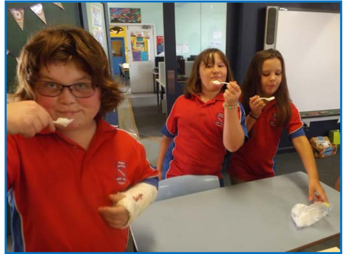
Making & Eating Ice Cream!