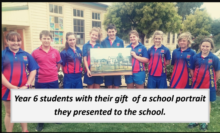
Year 6 students with their gift of a school portrait they presented to the school.