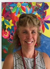
Mrs Michelle Nunn