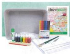
NEW Creative Kids Marbling CleverPack™ Code: 20284 $84.70 (inc GST) Each pack