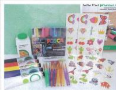
NEW Creative Kids Creative Decorating CleverPack™ Code: 20292 $84.70 (inc GST) Each pack