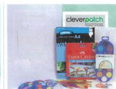
Creative Kids Watercolour CleverPack™ Code: 20012 $84.70 (inc GST) Each pack