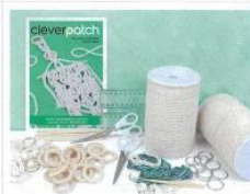
Creative Kids Macramé CleverPack™ Code: 20024 $84.70 (inc GST) Each pack

Creative Kids Vouchers are only available to eligible NSW residents. If you don't have a voucher, please visit service.nsw.gov.au .