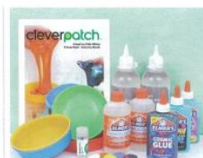
Creative Kids Slime CleverPack™ Code: 20016 $84.70 (inc GST) Each pack