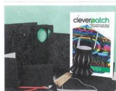
Creative Kids Scratch Board CleverPack™ Code: 20013 $84.70 (inc GST) Each pack