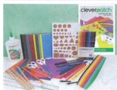
NEW Creative Kids Papercraft CleverPack™ Code: 20088 $84.70 (inc GST) Each pack