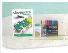
NEW Creative Kids Skateboard CleverPack™ Code: 20178 $84.70 (inc GST) Each pack