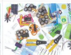
Creative Kids STEAM CleverPack™ Code: 20015 $84.70 (inc GST) Each pack

Creative Kids Vouchers are only available to eligible NSW residents. If you don't have a voucher, please visit service.nsw.gov.au .