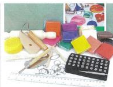
NEW Creative Kids Polymer Clay CleverPack™ Code: 20091 $84.70 (inc GST) Each pack