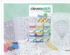
Creative Kids Sand Art CleverPack™ Code: 20014 $84.70 (inc GST) Each pack