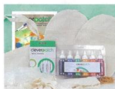
Creative Kids Tie Dye CleverPack™ Code: 20019 $84.70 (inc GST) Each pack